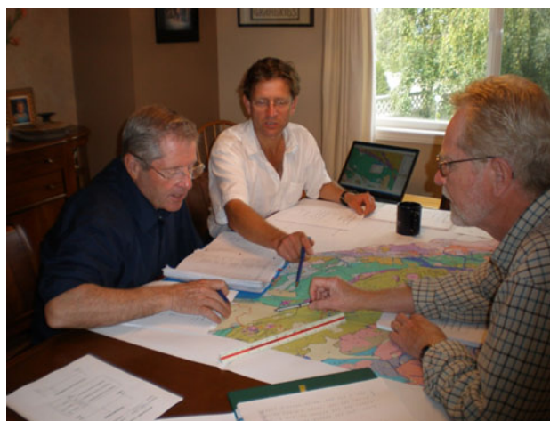
Figure 2: Experts discussing the mineral resource potential of a tract in the Atlin-Taku land-use planning area.

New staff members hired for the BCGS in late 2007 and in 2008 are