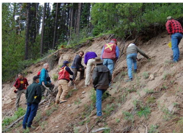
Figure 3. Field trip stop for the Smithers till prospecting workshop led by BCGS and GSC staff.

The MEMPR has partnered with universities and colleges since the 1940s to educate and inspire geoscience students and recent graduates. With its 23 permanent staff as professional mentors, the BCGS hired a total of 61 students and recent graduates over the past two years (Figure 4). These professionals in training have allowed us to deliver a